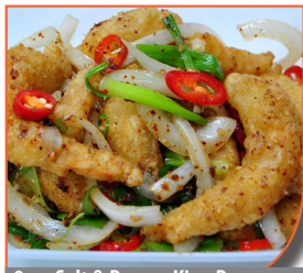
8. Salt & Pepper King Prawn