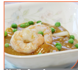
21. King Prawn Curry