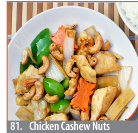
81. Chicken Cashew Nuts