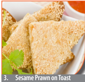
3. Sesame Prawn on Toast