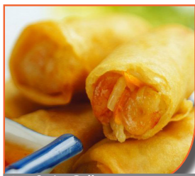
4. Spring Rolls