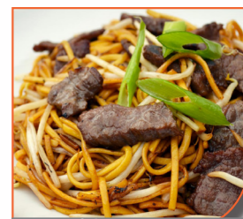
43. Beef Chow Mein