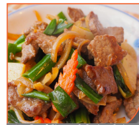
107. Beef Ginger & Spring Onion