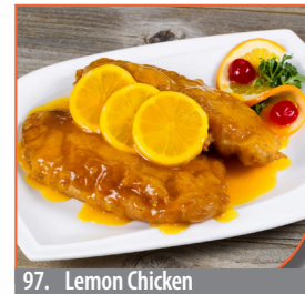
97. Lemon Chicken