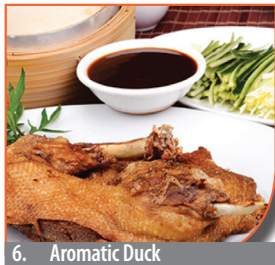
6. Aromatic Duck