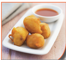
143. Sweet & Sour Chicken Balls